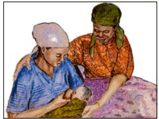
Counseling Card developed by LINKAGES Ghana

Mass media, particularly local radio, extended reach of the program's messages. Radio campaigns intensified during annual World Breastfeeding Weeks in August. Over 4 years,